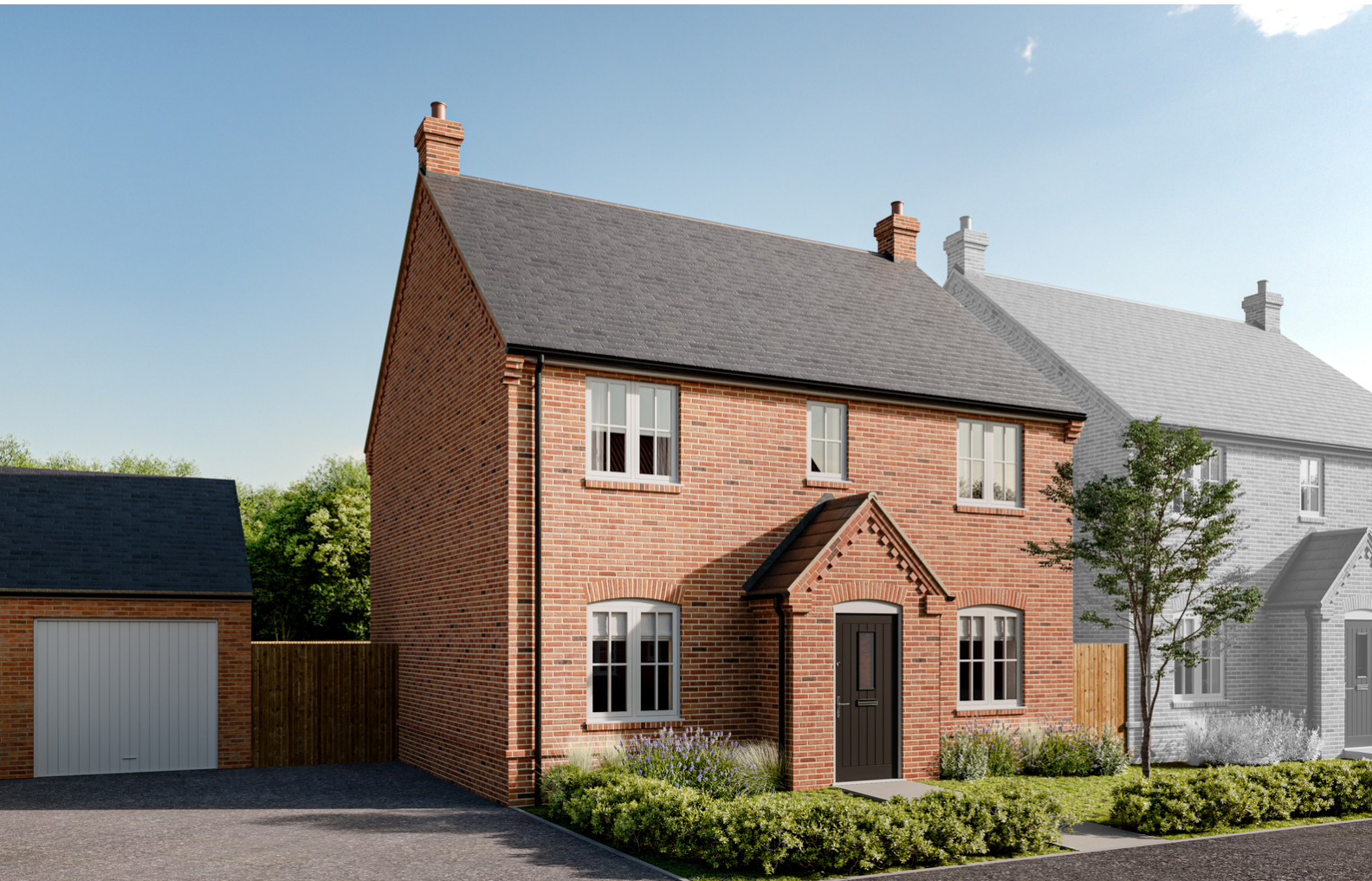
The Kingston Plot 1, Damgate, Holbeach, Lincolnshire PE12 7AX