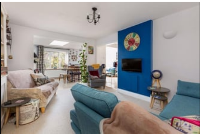
14' 5" x 11' 1" (4.39m x 3.38m) chimney breast with built in storage, double radiator, opening leads through to the family room, door to hallway.