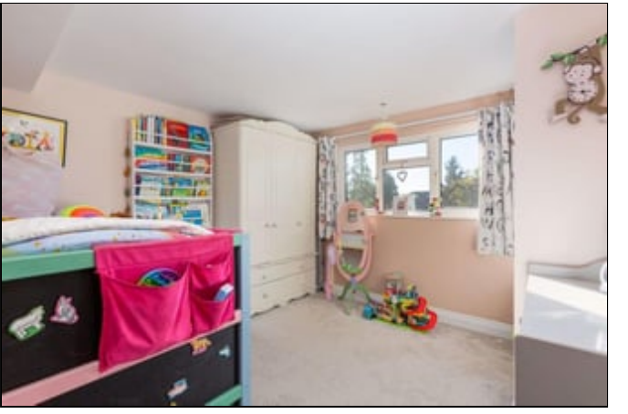
13' 8" narrowing to 11' 6" x 11' (4.17m x 3.35m) double glazed window to the rear, attractive fitted shelving, radiator.