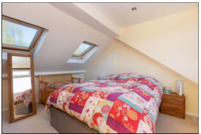
12' x 10' 9" (3.66m x 3.28m) double glazed sky light windows to the front, double glazed window to the rear with lovely far reaching views, halogen down lighting, television point, radiator, built in wardrobe cupboards.