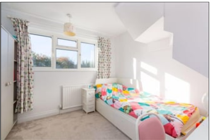
10' 1" x 9' 8" (3.07m x 2.95m) double glazed window to the rear, radiator.