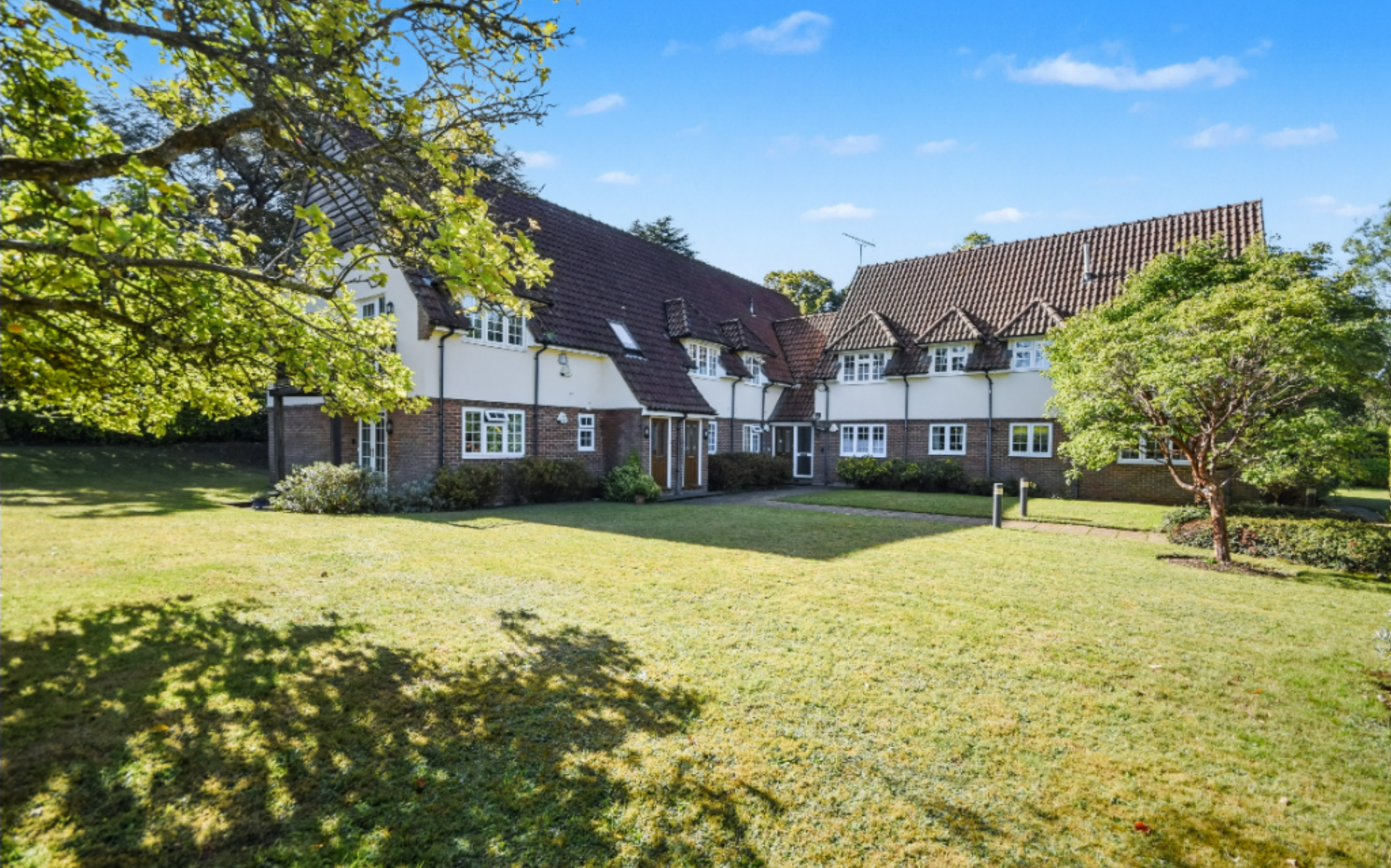
Flat 4 Headon Court, The Close, Farnham, Surrey. GU9 8DR. Guide Price £589,950