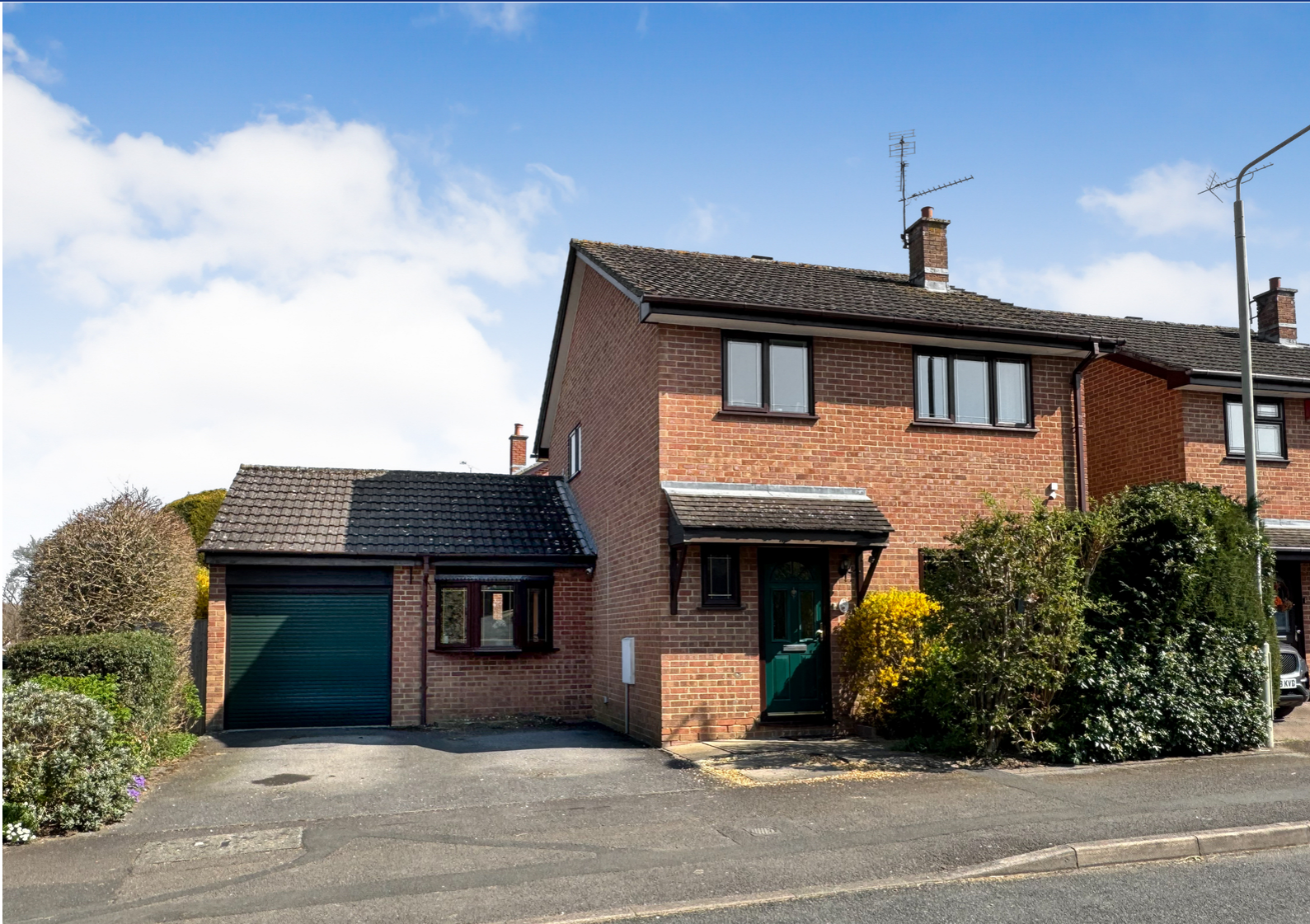
Clements Mead, Tilehurst, Reading, Berkshire.