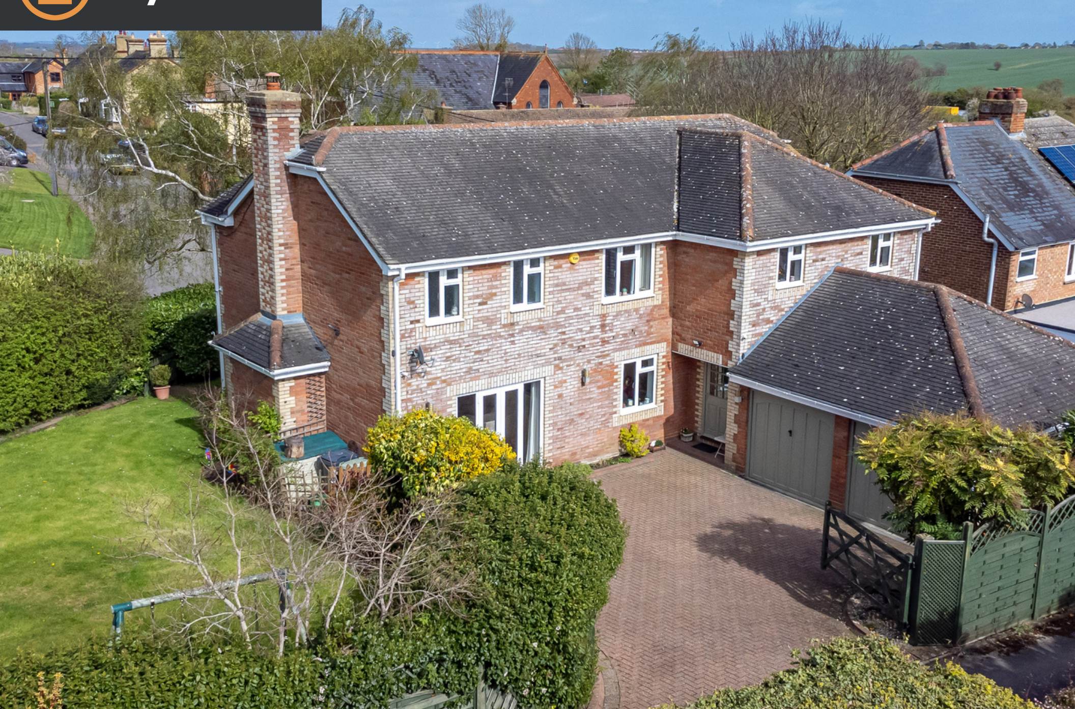
The Pygthle, Gravenhurst Guide Price £795,000