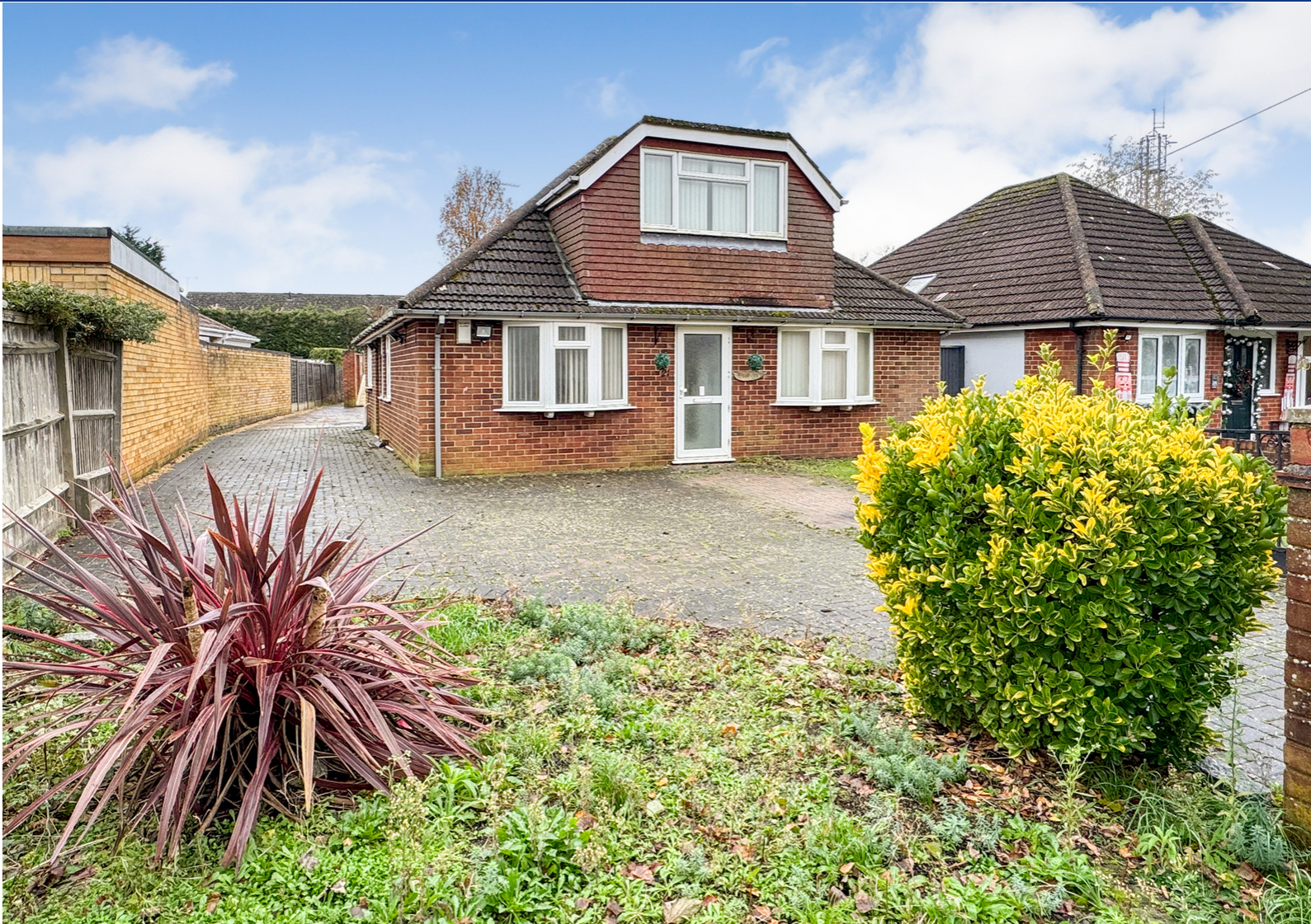
Firs Road, Tilehurst, Reading.