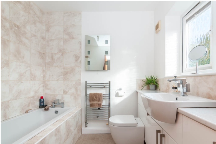
Bedroom & En Suite