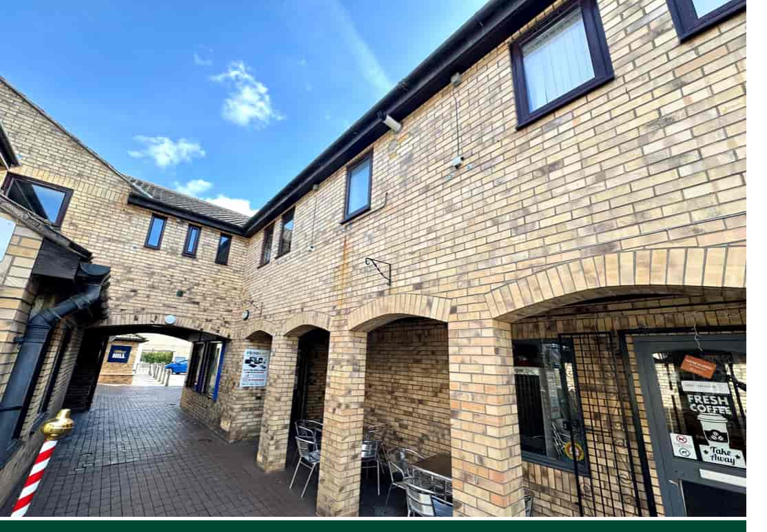
12a Newtons Court, Huntingdon PE29 3NQ