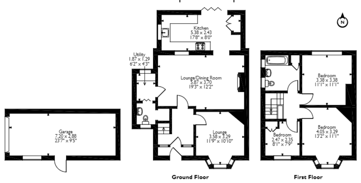
Please note that the location of doors, windows and other items are approximate and this floorplan is to be used for illustrative purposes only. Unauthorized reproduction is prohibited.