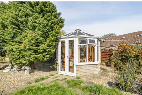
Guide £500,000 - £525,000 Freehold

Enjoying a sought-after location on the Bath side of Frome, this impressive, detached family size property comes with plenty of driveway parking, a single garage and extensive enclosed back gardens.