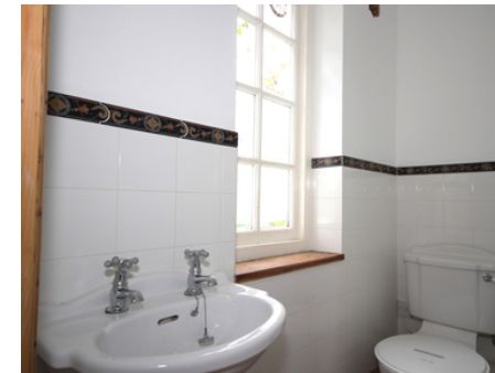
8 Sollershott Hall, Letchworth Garden City, Hertfordshire, SG6 3PN