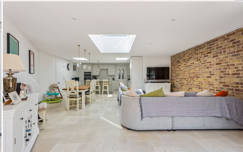
Chequers Orchard Iver, Buckinghamshire, SL0 9NJ