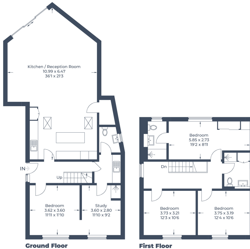
Illustration for identification purposes only, measurements are approximate, not to scale. © CJ Property Marketing Produced for Rodgers Estate Agents