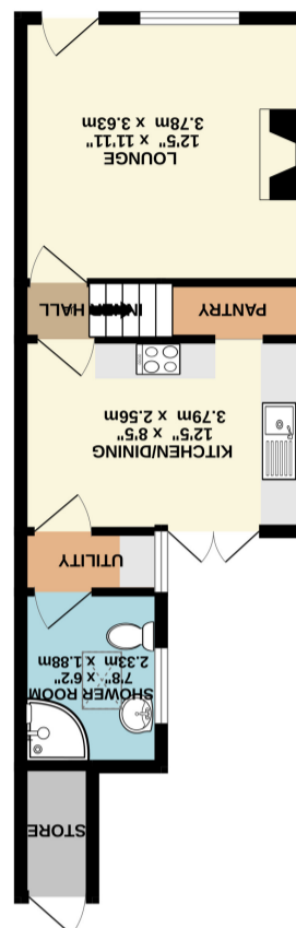
FERN STREET, YORK, YO31 7QU TOTAL FLOOR AREA - 626 sq. ft. (58.2 sq. m.) approx.

While every attempt has been made to ensure the accuracy of the floorplans contained here, measurements of windows, doors and other items are approximate and no responsibility is taken for any error, omission or mis-statement. This plan is for illustrative purposes only and should be used as such. By any means with Mapbox ©2023