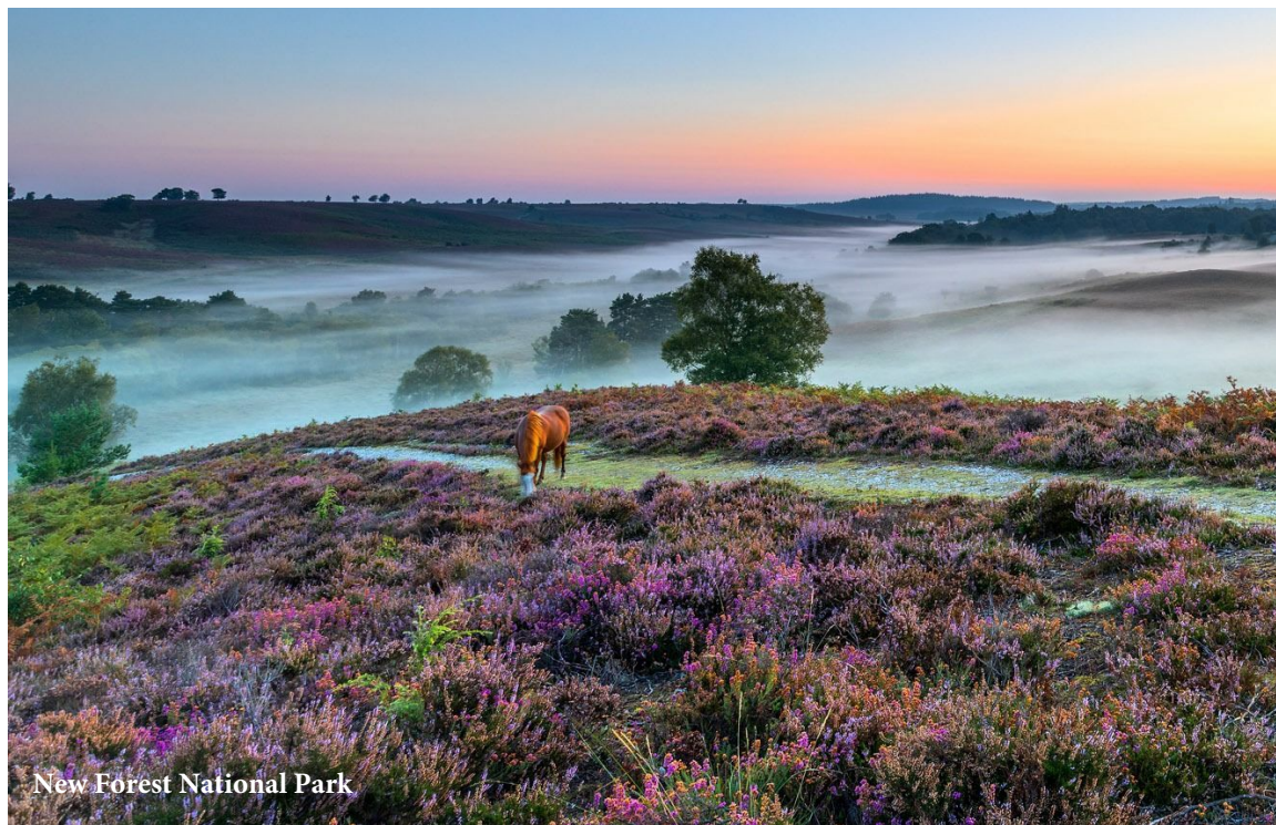
New Forest National Park