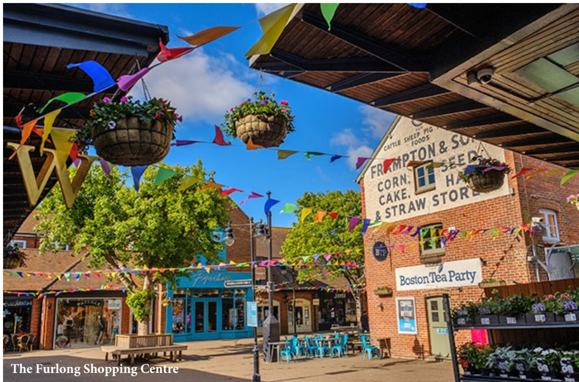
The Furlong Shopping Centre