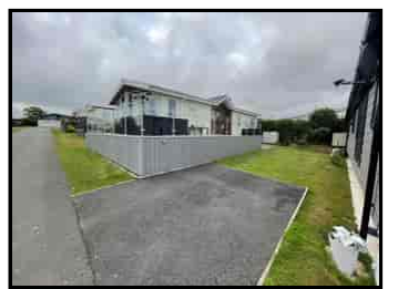
Pitch M4 Ocean Heights Leisure Park, Maenygroes, New Quay, Ceredigion. SA45 9RL