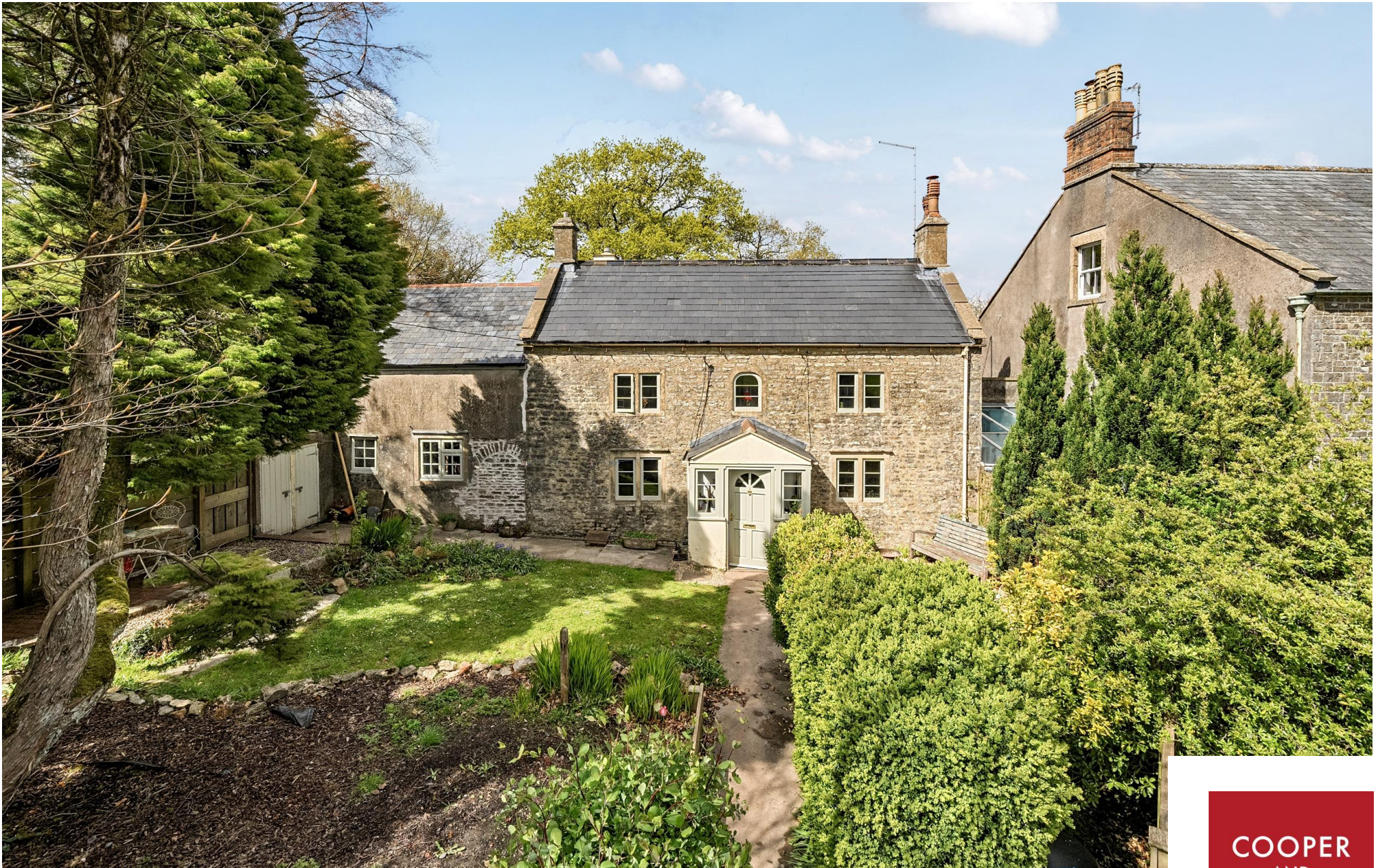
Broadway Cottage, Emborough, Nr Radstock, BA3 4RY