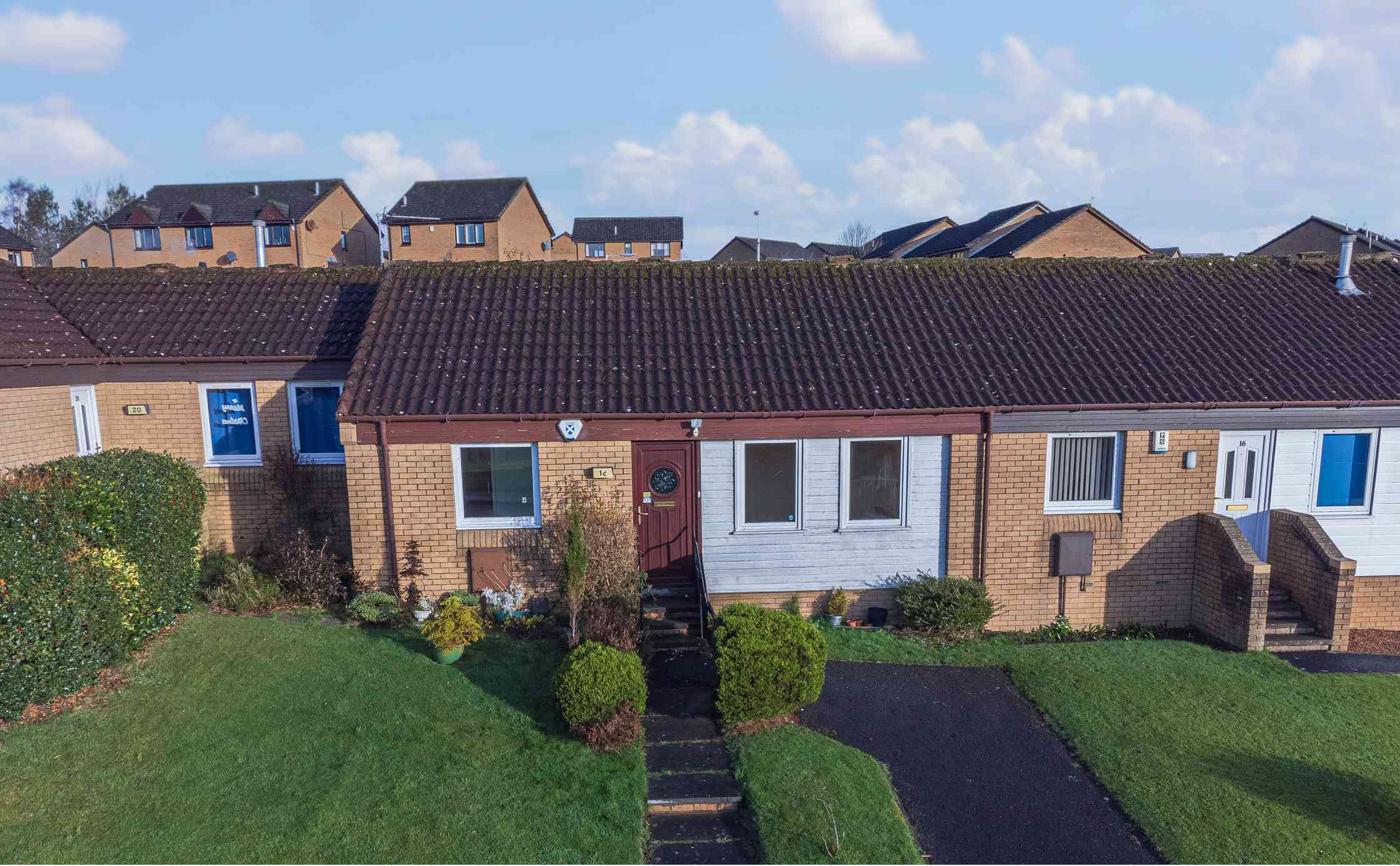
Offers Over £114,000 18 Drummond Place, Dunfermline, Fife, KY12 0XA