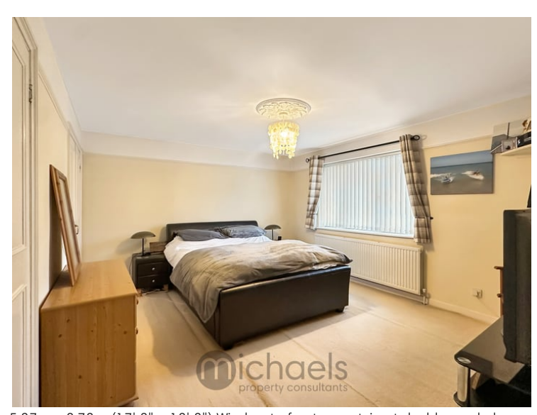
5.27 \, \mathrm{m} \times 3.72 \mathrm{m} (17' 3" x 12' 2") Window to front aspect, inset double wardrobe, radiator, door to: