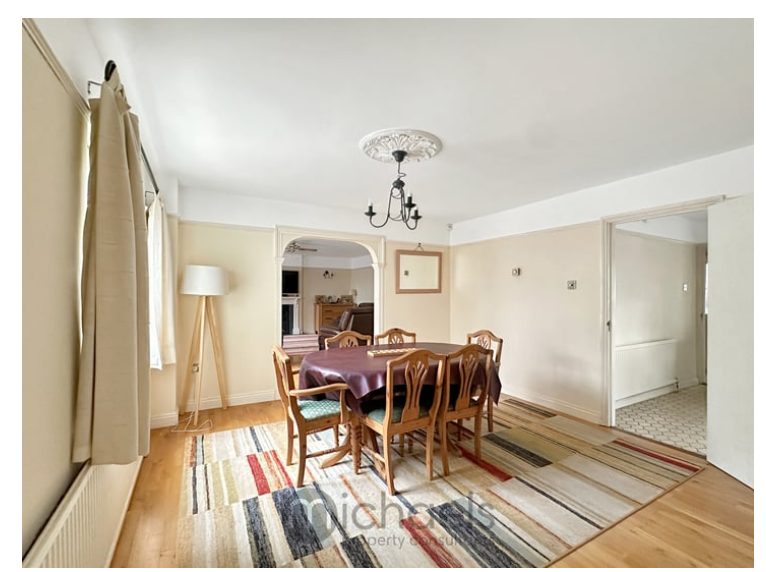
4.02 \text{m} \times 4.17 \text{m} (13' 2" x 13' 8") Window to rear aspect, radiator, opening to: