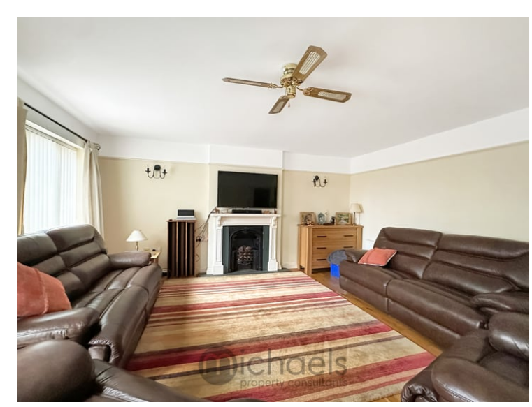
6.01m x 4.7m (19' 9" x 15' 5") Window and door to rear aspect (leading to rear garden), radiator x2, inset feature fire place with tiled hearth and mantle over