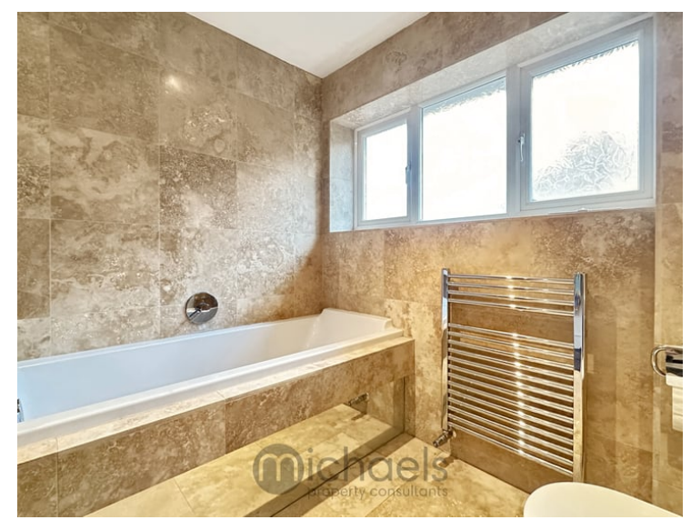
3.24 \text{m} \times 2.46 \text{m} (10' 8" \times 8' 1") Window to rear aspect, W.C, chrome wall mounted towel rail, inset tiled surround bath, wall mounted wash hand basin, walk in wet room style shower