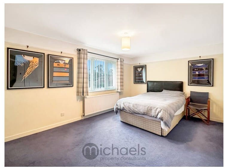
3.4m \times 4.9m \; (11' \; 2" \times 16' \; 1") Window to front aspect, radiator, inset double wardrobe, door to: