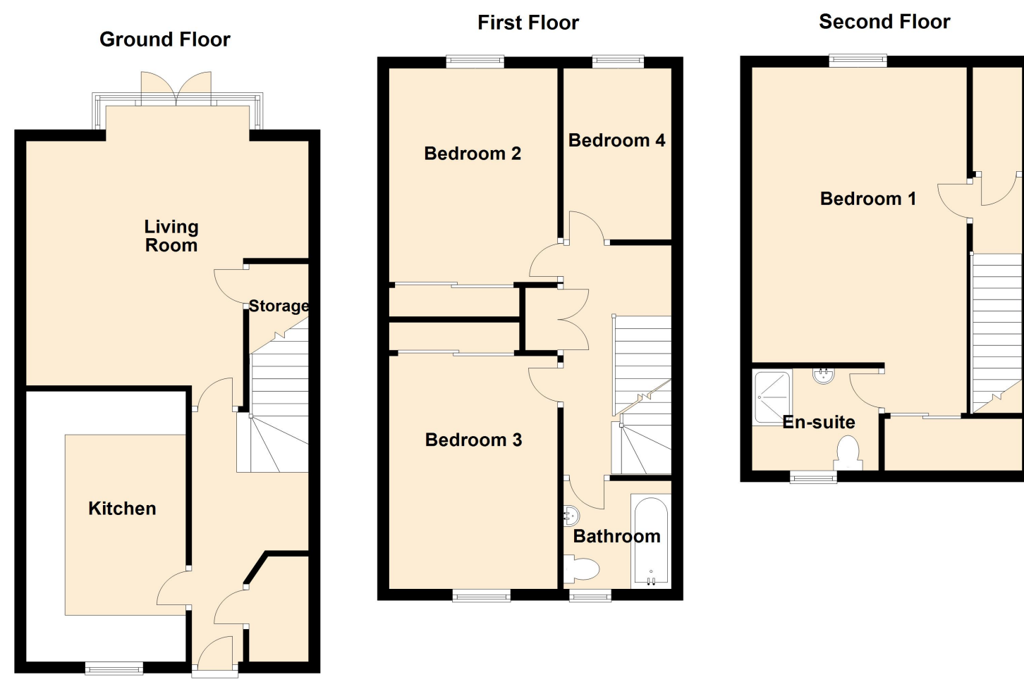
Floor plans are for layout purposes only. Measurements are approximate and subject to inaccuracies Plan produced using PlanUp.