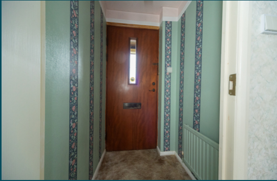
Property at a glance: