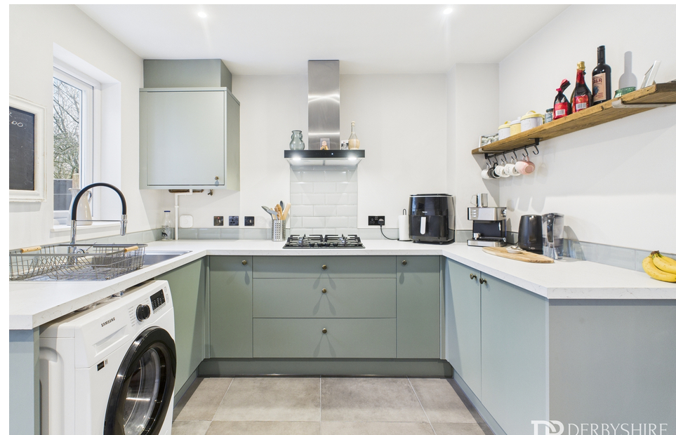
30 Walcote Close, Belper, Derbyshire DE56 0HA £220,000 - Freehold