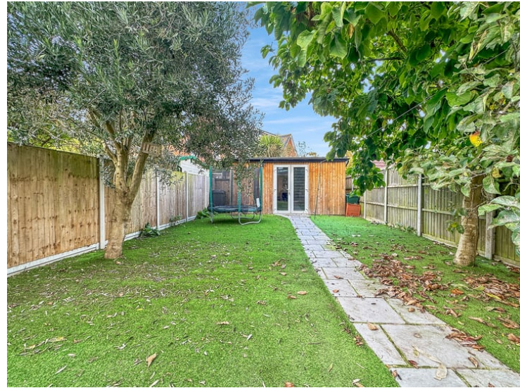
Outside, the property boasts a private and enclosed rear garden. The garden commences with an expansive patio area, ideal for outdoor seating and al-fresco dining. The rear extension is complimented with outdoor lighting, whilst the remainder of the garden is predominately laid with artificial lawn. A pathway leads to the rear of the garden, were a large outdoor office/garden room can be found benefitting from full power and double glazing. The garden also features two mature trees. To the front, off road parking is available on a private driveway.