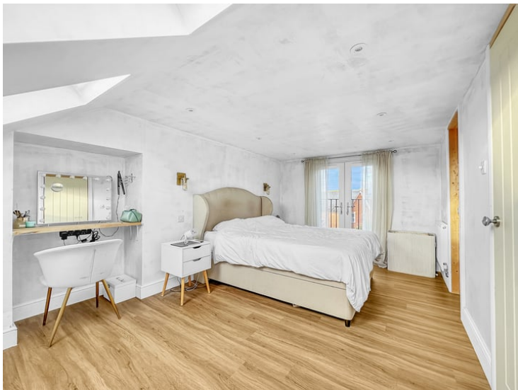
4.65m x 2.87m (15' 3" x 9' 5") Velux windows to front aspect, patio doors (Juliet balcony) to rear aspect, radiator, eaves storage, access to: