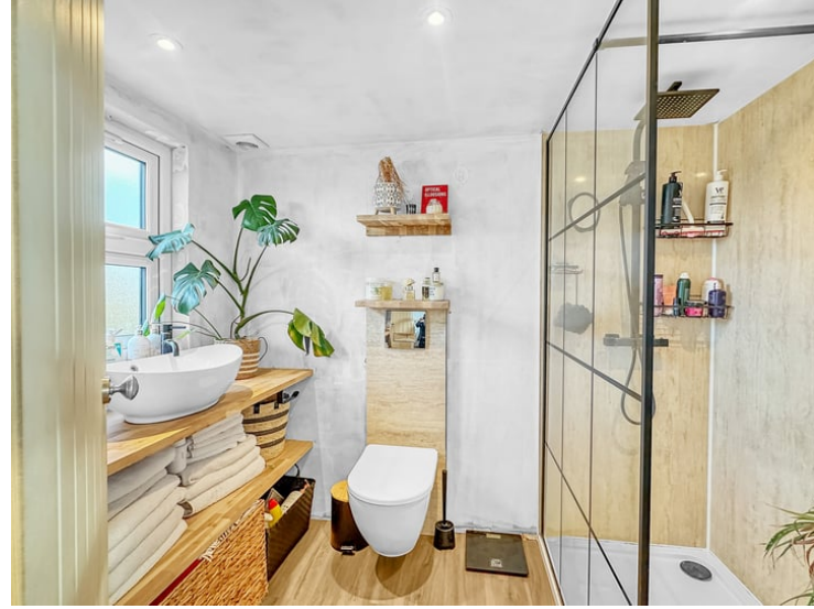
Vanity wash hand basin, W.C., shower cubicle with contrasting matte black shower heads, inset spotlights, window to rear aspect