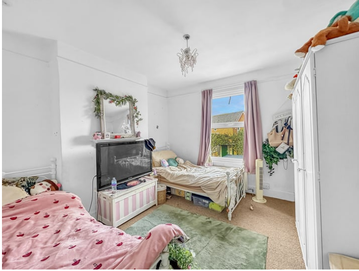
3.6m x 3.3m (11' 10" x 10' 10") Window to rear aspect, radiator