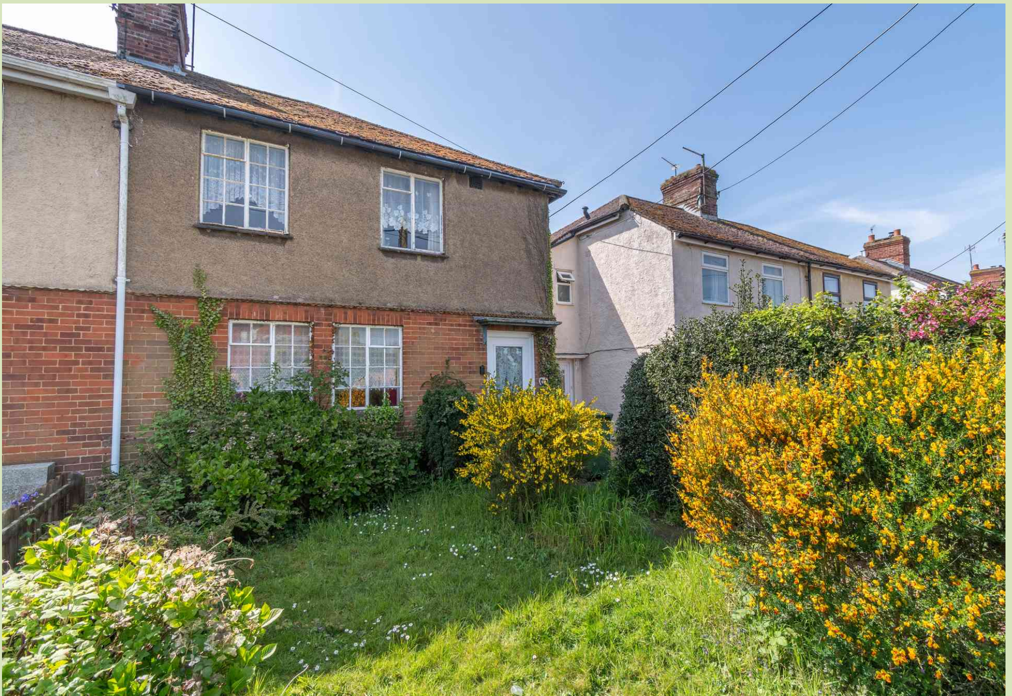
18 Dereham Road, Pudding Norton Guide Price £180,000