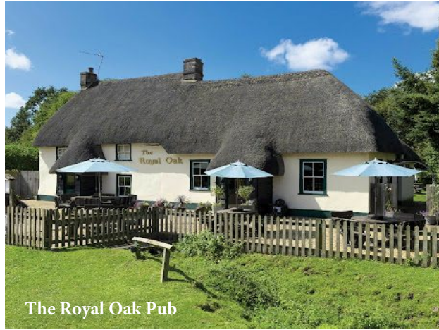
The Royal Oak Pub