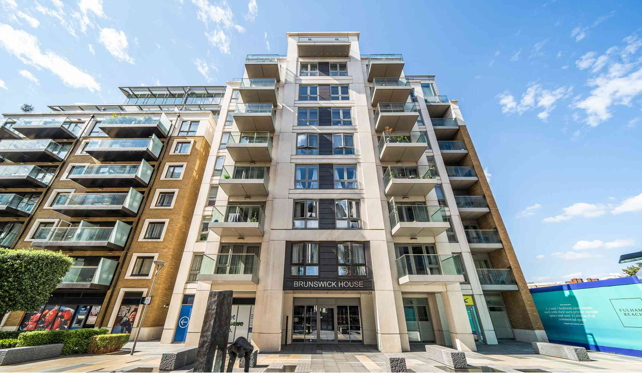
Parr's Way, London, W6 9LH