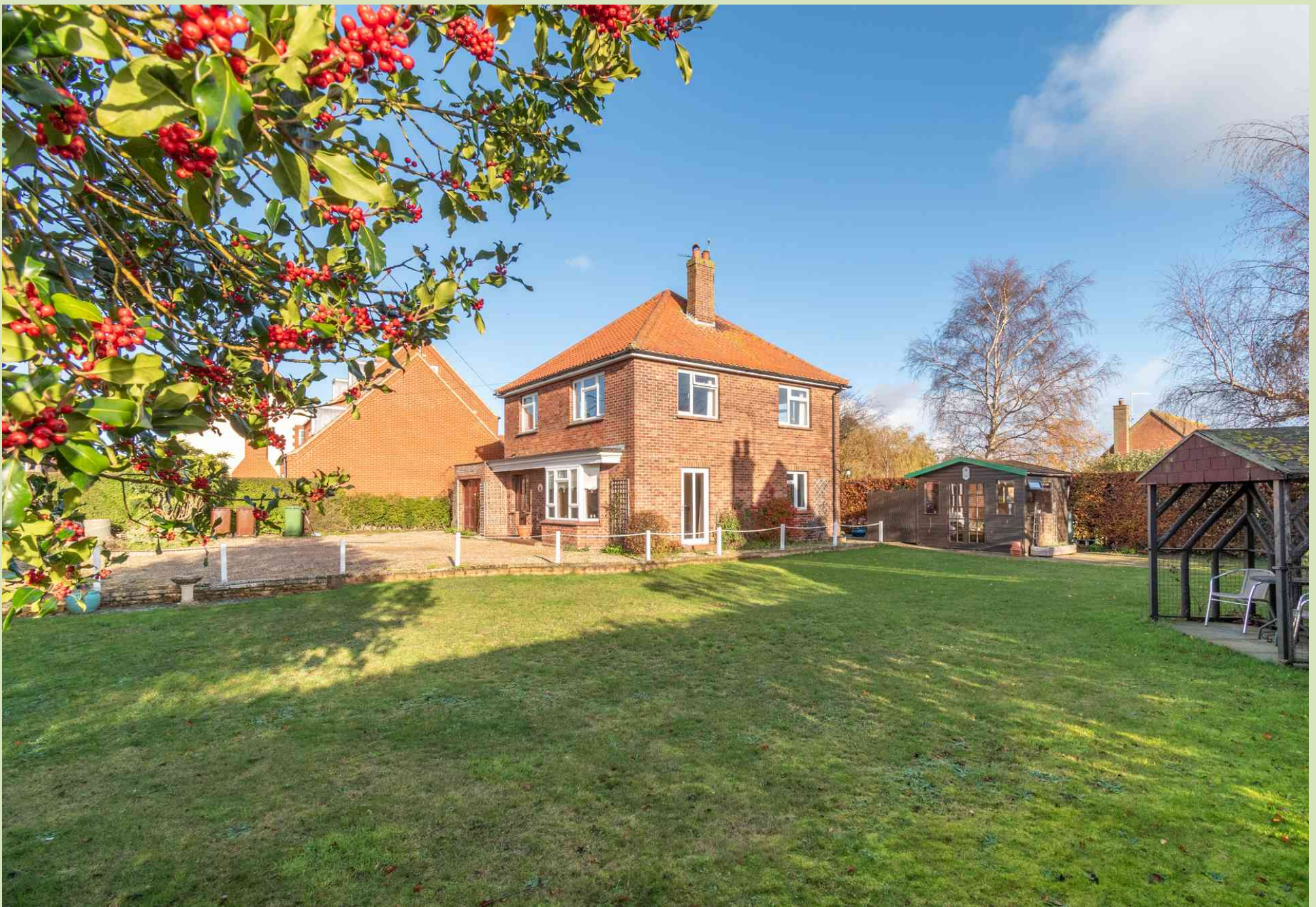
Meadside, Wells-next-the-Sea Guide Price £685,000