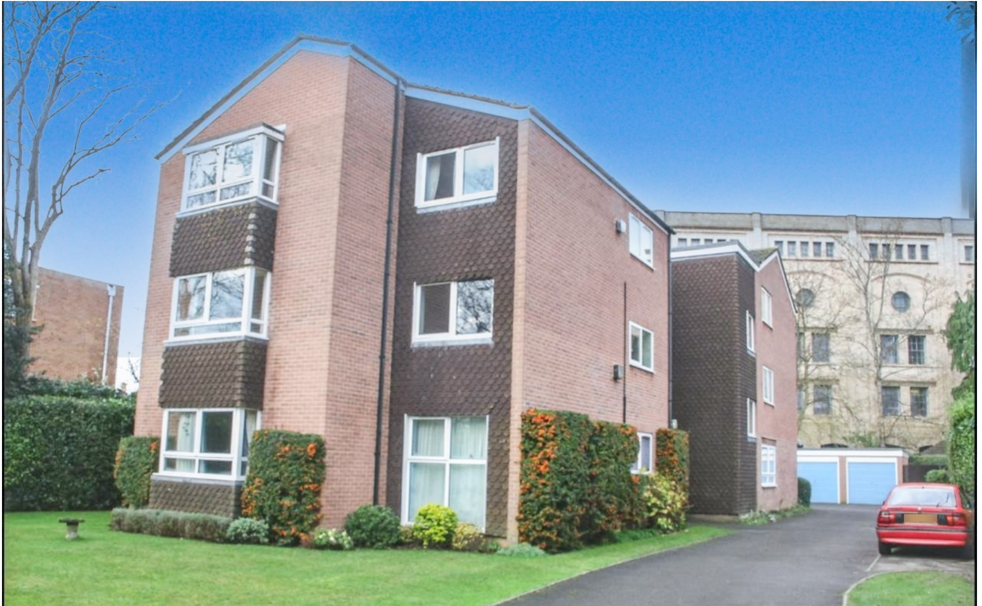
Grosvenor Road, Bournemouth BH4 8BQ