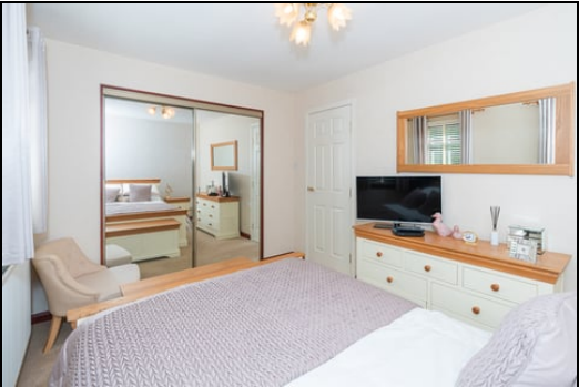
3.7m x 3.1m (12' 2" x 10' 2")