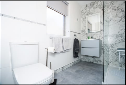
1.6m x 2.6m (5' 3" x 8' 6")