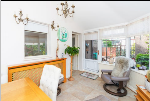
3.3m x 4.0m (10' 10" x 13' 1")