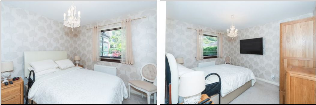
3.3m x 2.9m (10' 10" x 9' 6")