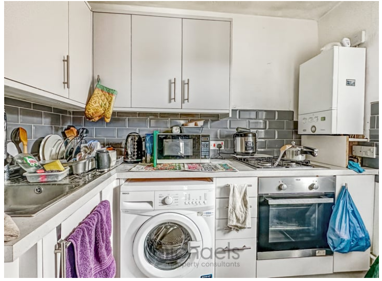
8'\ 2"\ x\ 6'\ 10" ( 2.49m\ x\ 2.08m ) Modern range of base and eye level units, work surfaces with inset stainless steel sink and drainer unit, part tiled walls, integrated oven and hob with extractor fan over, space for washing machine, inset spotlights.