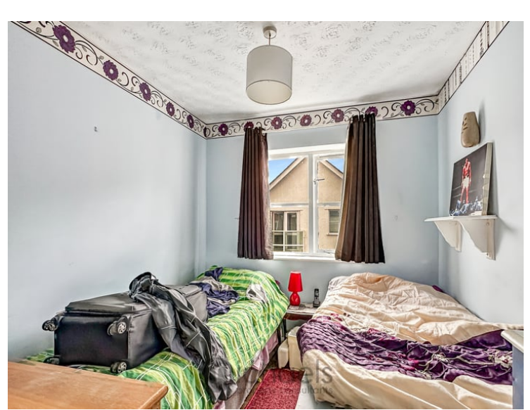
8' 7" x 7' 9" (2.62m x 2.36m) UPVC window to front aspect, wall mounted radiator.