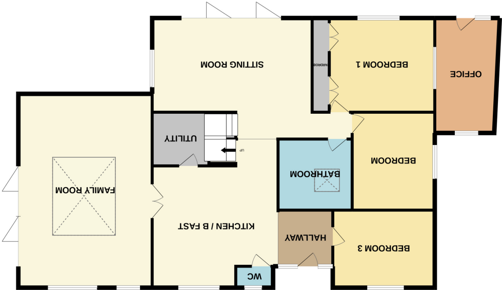
GROUND FLOOR 2614 sq.ft. (242.9 sq.m.) approx.