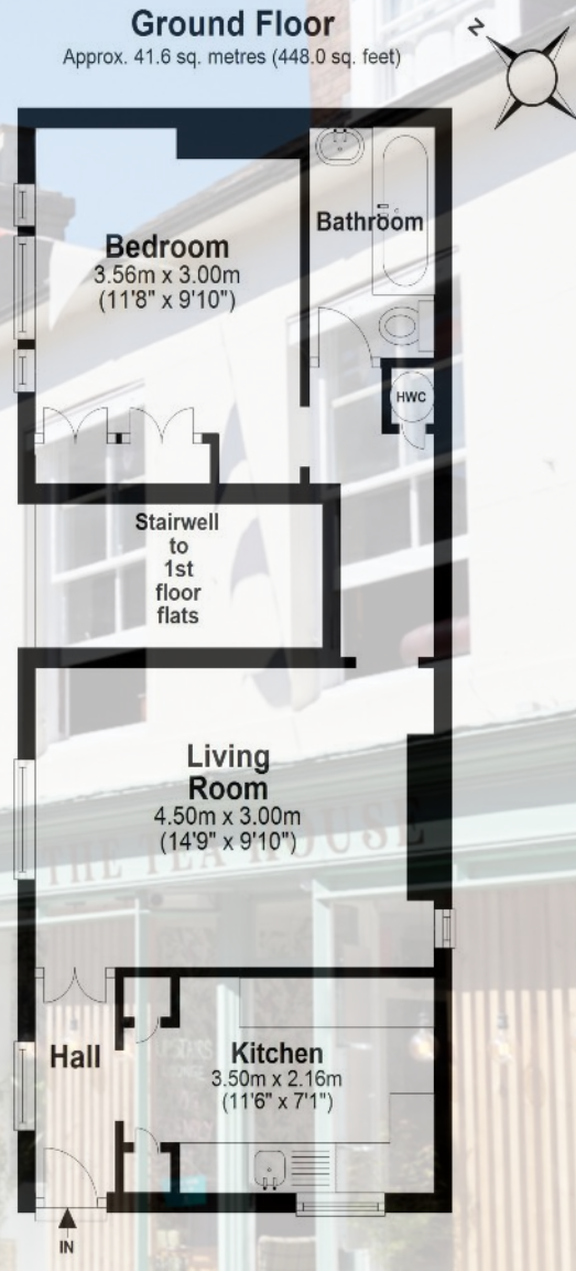
Illustration for identification purposes only; measurements are approximate, not to scale. FP USketch Plan produced using PlanUp.