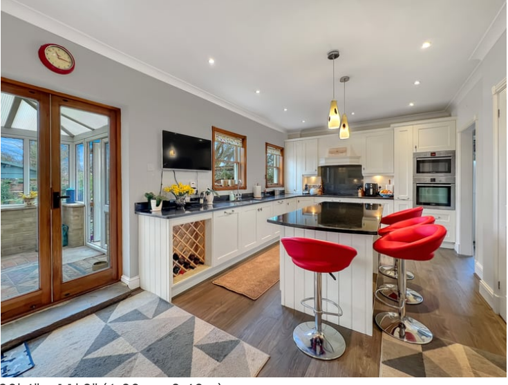
20' 4" x 11' 2" (6.20m x 3.40m)