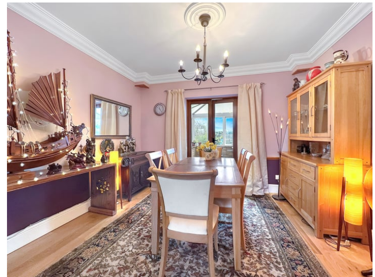
11'11" x 10'9" (3.63m x 3.28m)