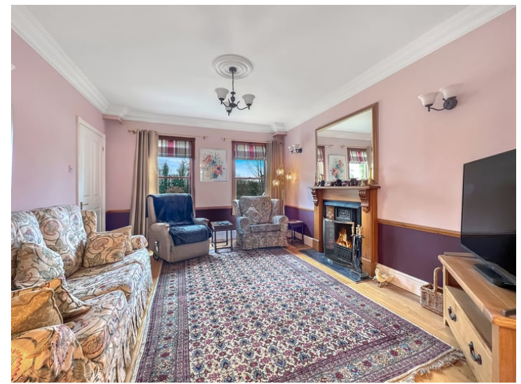
15'4" x 11'11" (4.67m x 3.63m)