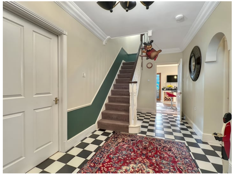
17'7" x 8'0" (5.36m x 2.44m)