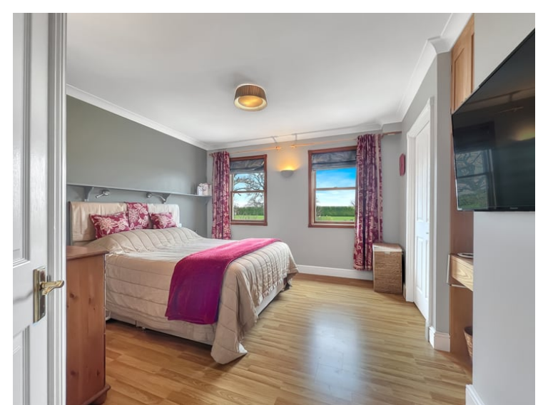
12' 3" x 11' 3" (3.73m x 3.43m)