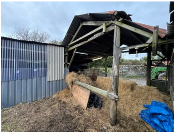
YR HEN MOFRA DU

16' 0" x 42' 0" (4.88m x 12.80m) Stone and slate range being the former workers cottage being capable of reinstatement with notable features such as the original fireplace, this would be subject to the necessary consent. Split into 2 separate rooms with 2 stable loose boxes, side window, water connection, connecting door into: