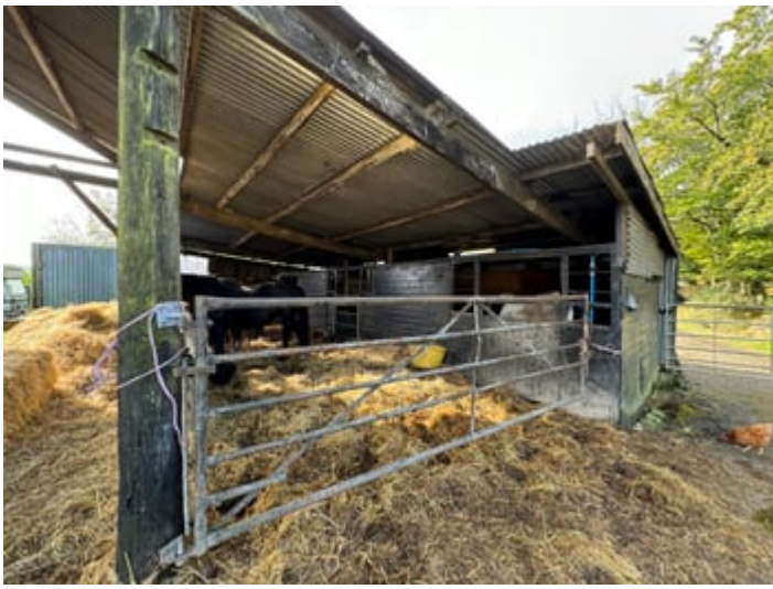
Side Hay Barn