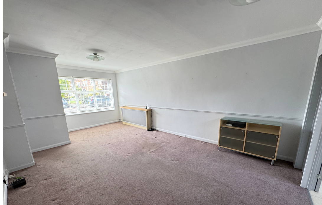
30 Shaftesbury Crescent, Staines-upon-Thames, Surrey TW18 1QW £499,950 - Freehold