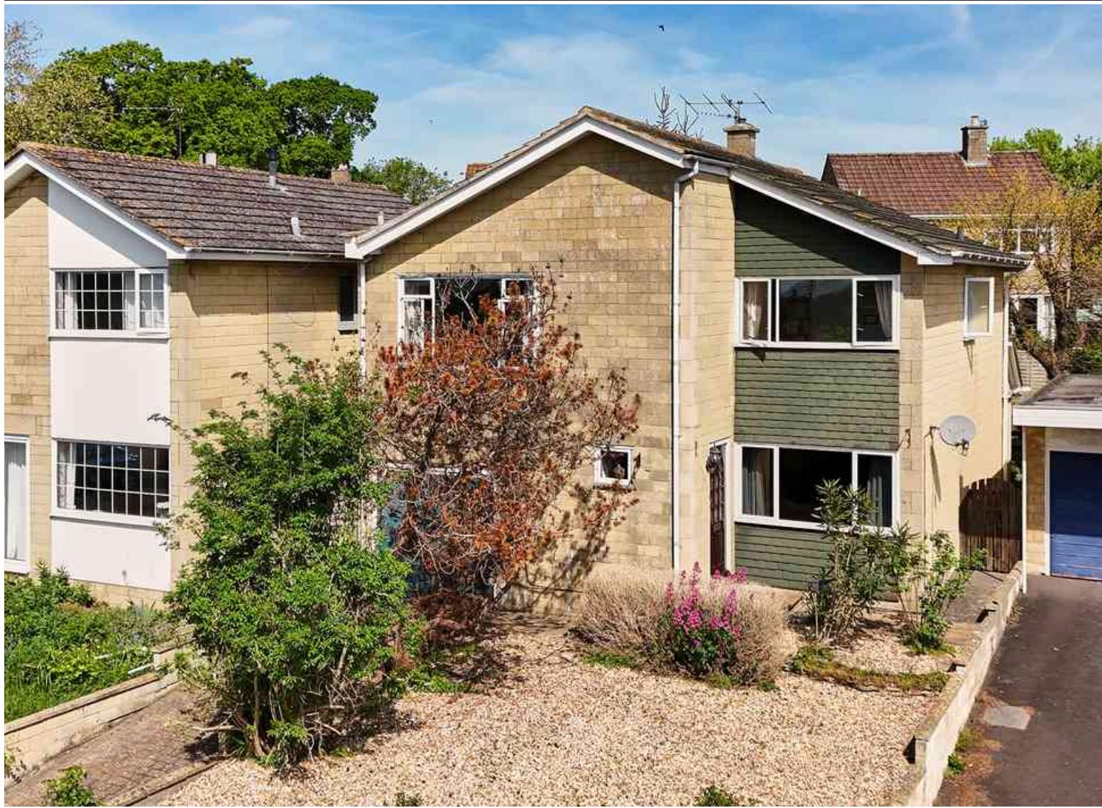
28 The Pastures, Lower Westwood