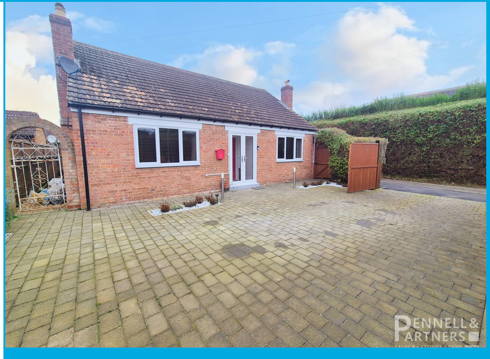
31 ARNOLDS LANE, WHITTLESEY, PETERBOROUGH, CAMBRIDGESHIRE. PE7 1QD