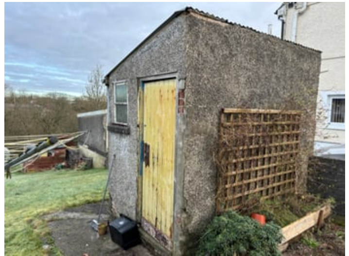
VARIOUS GARDEN SHEDS