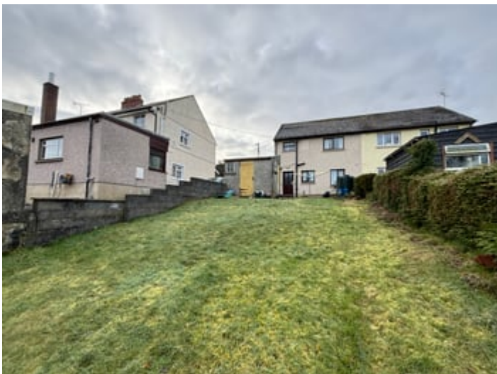
REAR GARDEN (THIRD IMAGE)