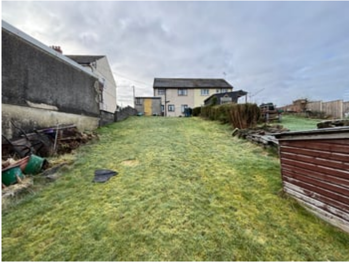
REAR GARDEN (SECOND IMAGE)