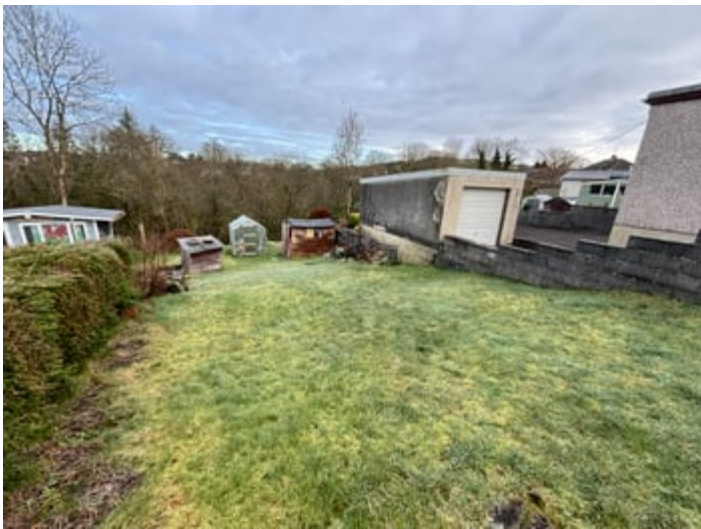
REAR GARDEN (THIRD IMAGE)