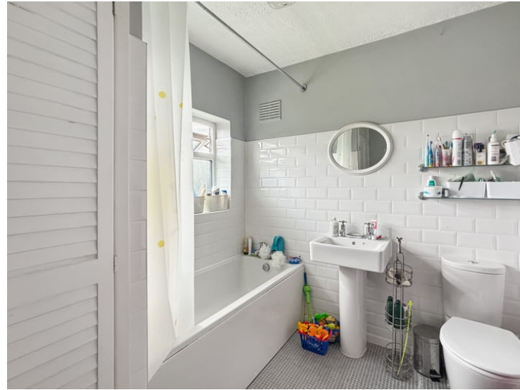
8' 5" x 7' 5" (2.57m x 2.26m) Window to rear, heated towel rail, access into airing cupboard, single paneled bath with over head shower, wash hand basin and W/C.