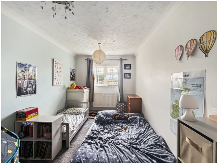
16' 11" x 7' 11" (5.16m x 2.41m) Window to front, and radiator.