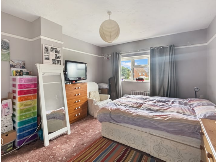
10' 11" x 12' 11" (3.33m x 3.94m) window to rear, and radiator.