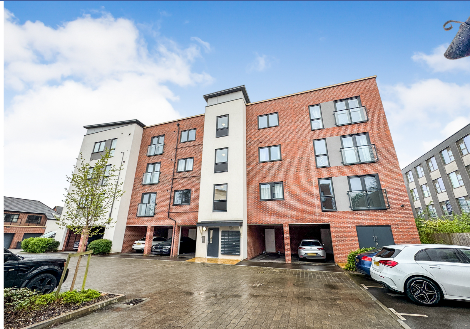
Elvian Close, Reading, Berkshire.