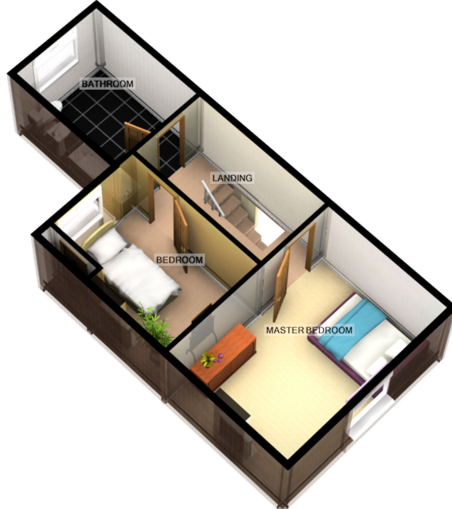
1ST FLOOR APPROX. FLOOR AREA 402 SQ.FT. (37.4 SQ.M.)