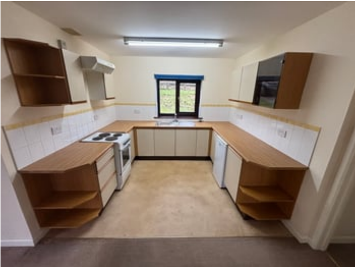
KITCHEN/DINER (THIRD IMAGE)