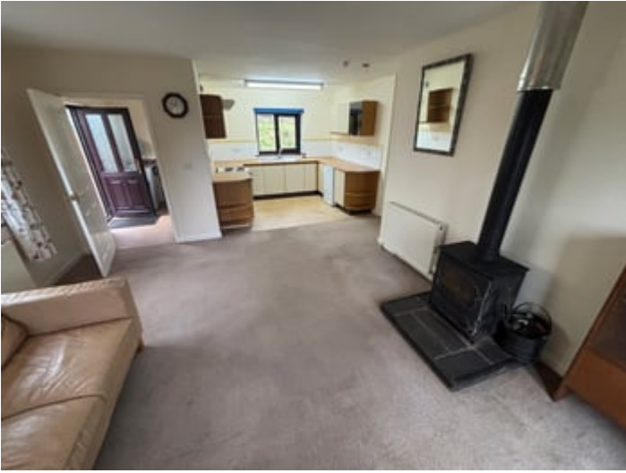
KITCHEN/DINER (SECOND IMAGE)

In open plan - 24' 2" x 15' 6" (7.37m x 4.72m). With fitted wall and floor units, electric hob and electric oven beneath with extractor fan over, 1 1/2 bowl single drainer stainless steel sink unit, fridge space, radiator, telephone point, French door opening onto the patio area, two radiators.