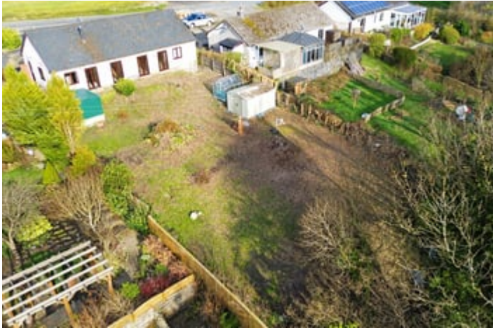
GARDEN (THIRD IMAGE)