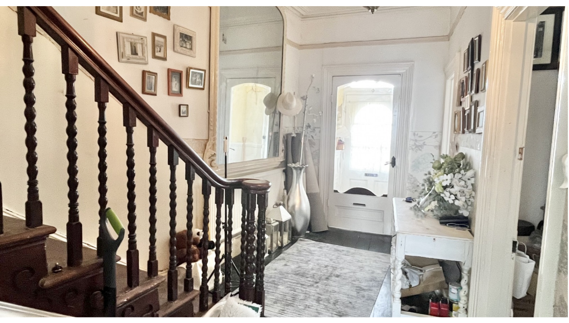
A 4 Bed Maisonette on the Upper Floors of this Esplanade Residence in Burnham-on-Sea