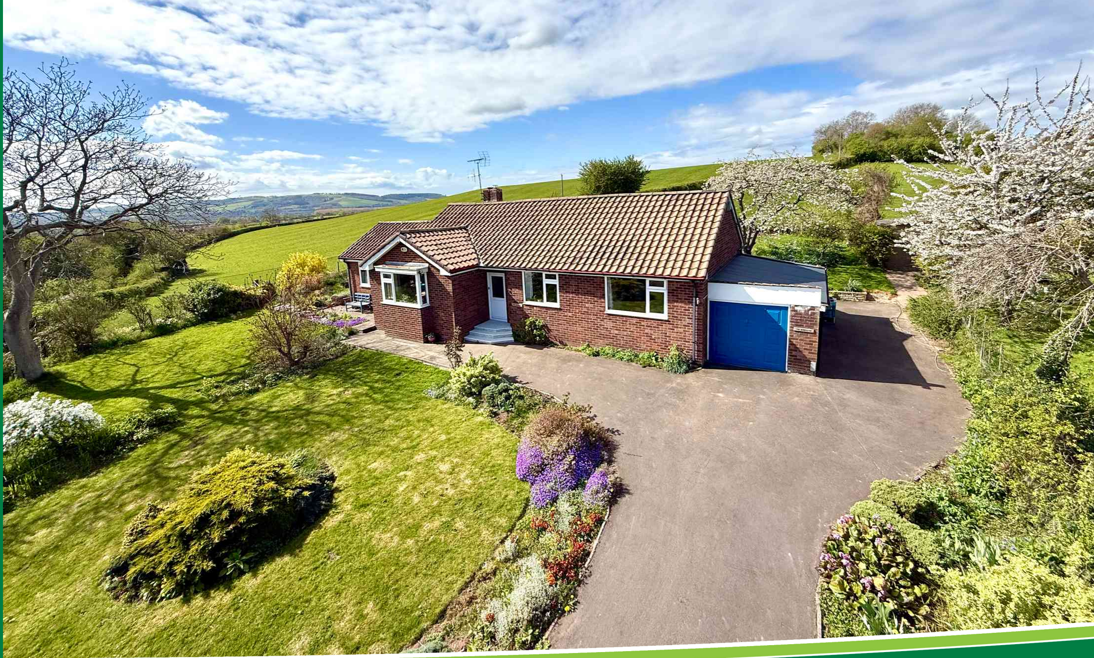
The Bungalow, Lower Eggleton, Ledbury, Herefordshire HR8 2TZ