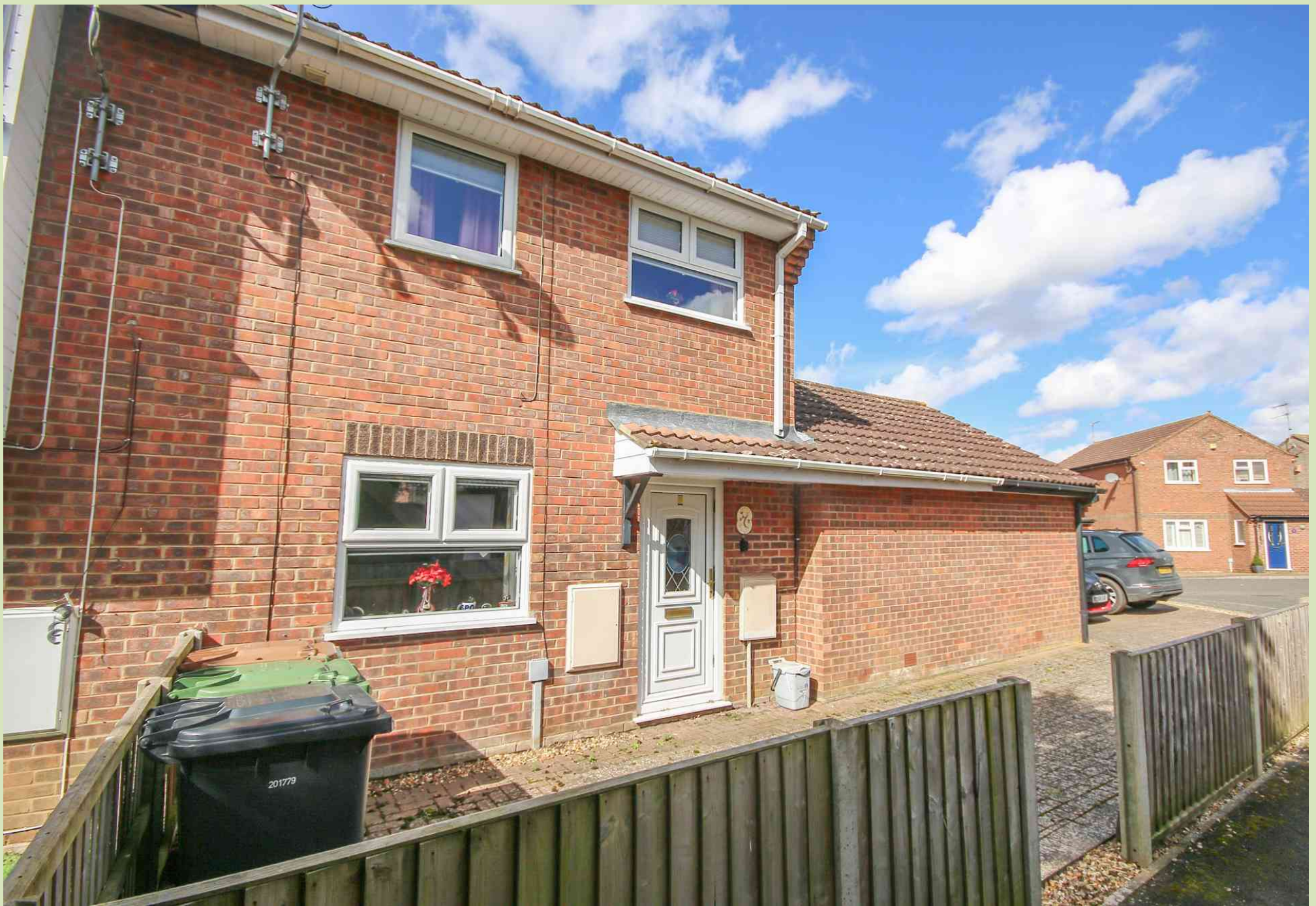
7 Lamport Court, King's Lynn Guide Price £240,000