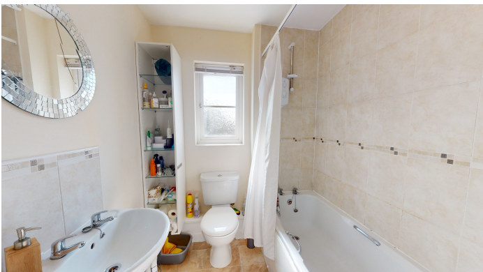
Modern Bathroom comprising of a toilet, wash hand basin and a bath with shower overhead. Useful shelving is also provided in the