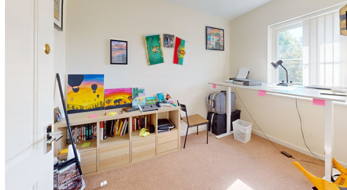
Second Bedroom which is of single proportions with a storage cupboard.