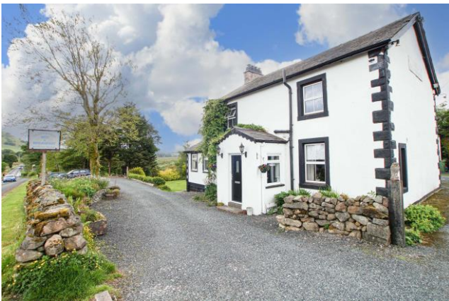
FRONT OF THE PROPERTY

GUEST UTILITY ROOM (16'5 x 5') Plumbing for washing machines, UPVC double glazed windows to the side, tiled flooring and UPVC double glazed door to the rear.