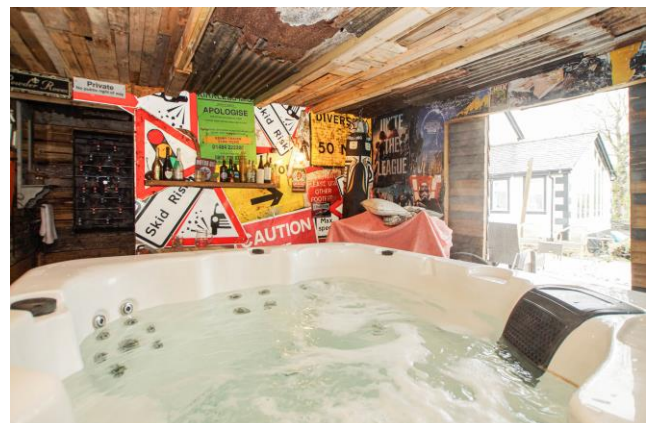
HOT TUB SHACK