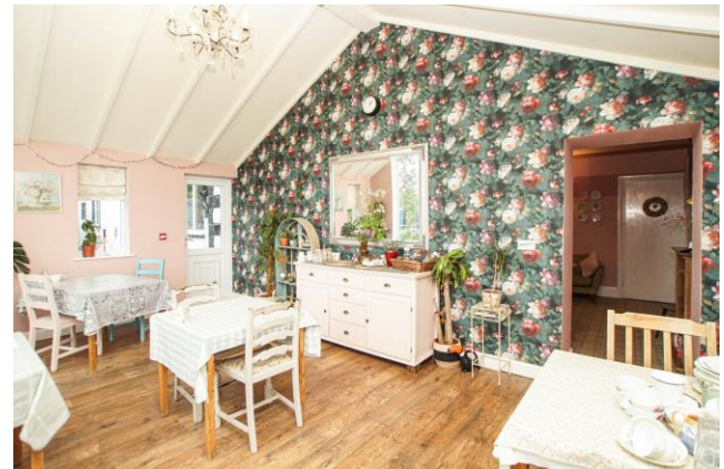
GUEST DINING ROOM

INNER HALL (9'6 x 7'3) Fitted wardrobes, wood effect laminate flooring, electric consumer unit, doors to dining kitchen and bathroom.