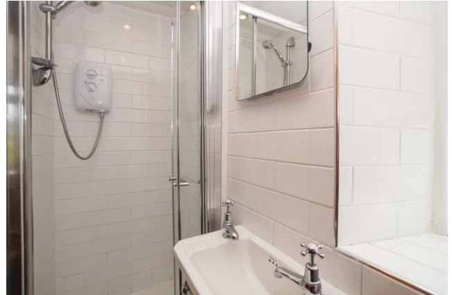
BEDROOM 1 EN-SUITE

GUEST LOUNGE (14' x 11'4) UPVC double glazed window to the front, radiator, fireplace housing a stove, archway to the dining room and access to the inner hall.