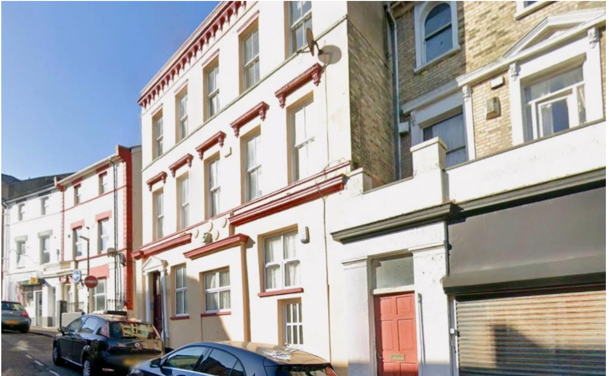
St Michael's Road, Bournemouth BH2 5DX