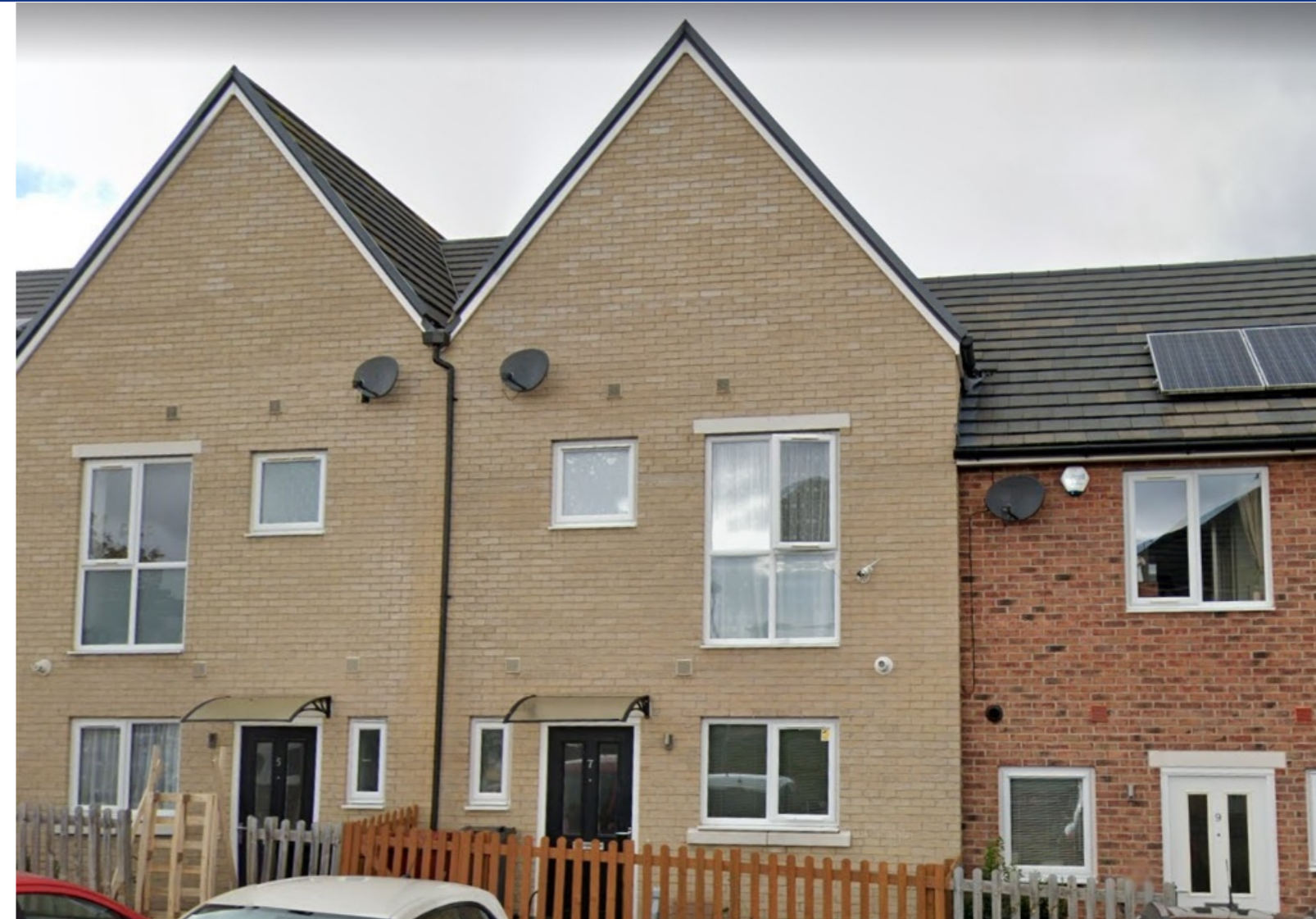
Eddleston Way, Tilehurst, Reading, Berkshire. RG30 4GY.