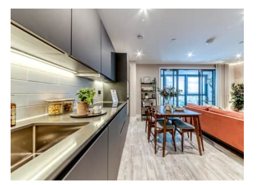
Station Road, Croydon, Surrey, CR0