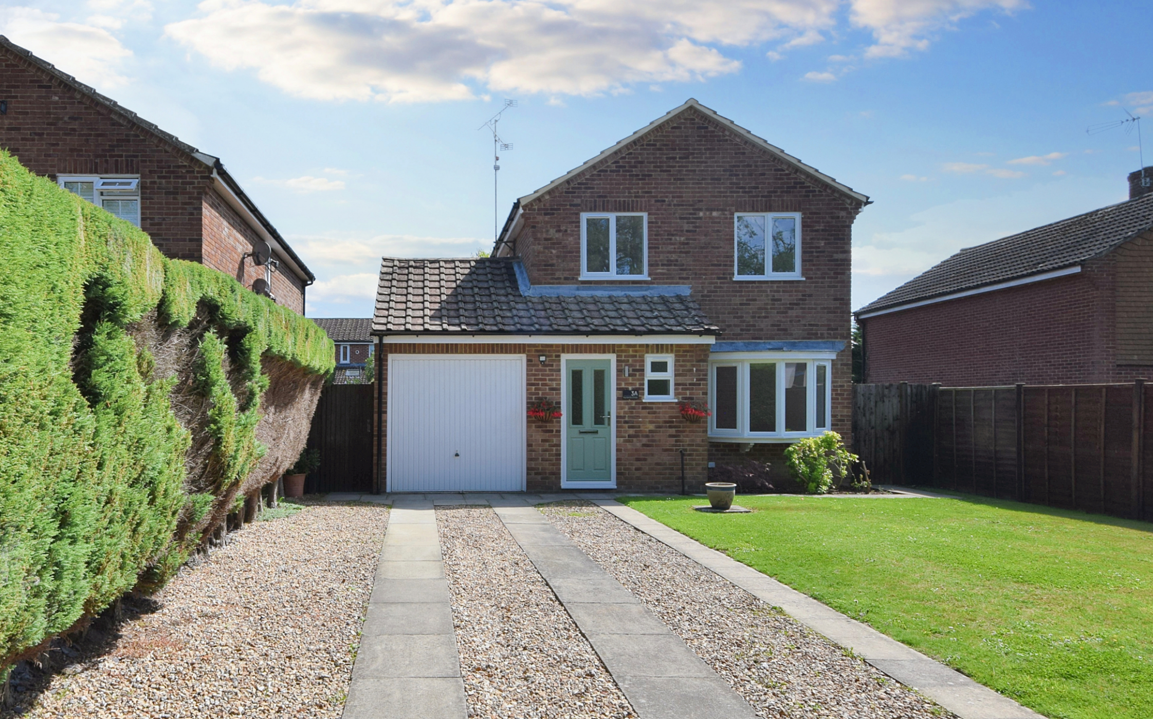
3a Hurlands Close, Farnham, Surrey. GU9 9JF. Guide Price £675,000